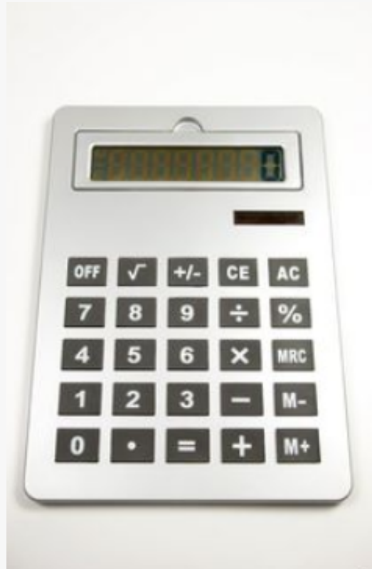
Estimate Tax Refunds