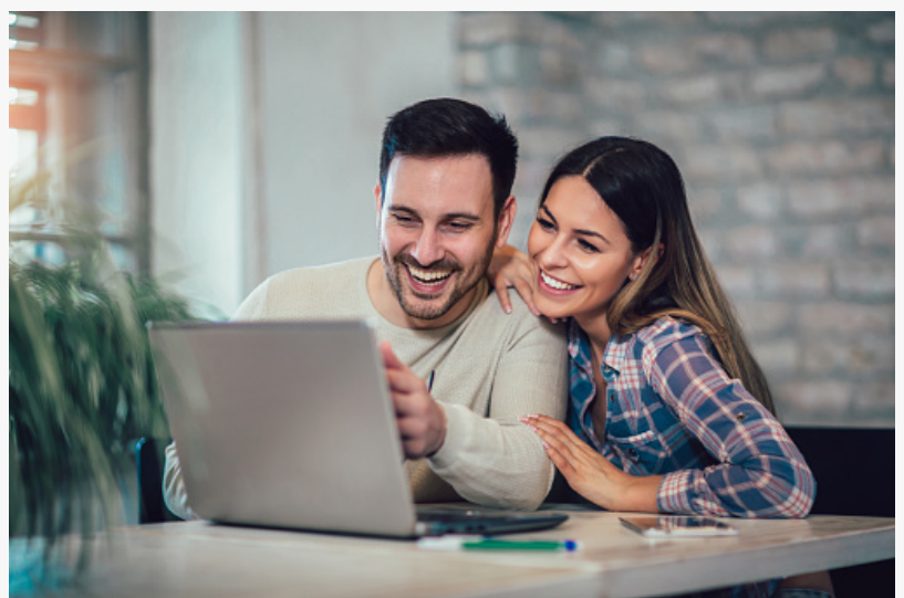
Tax Refund Estimator

User-Friendly Interface: Designed with simplicity in mind, the estimator offers a user-friendly interface that guides users through the process step by step. You don't need to be a tax expert to benefit from its insights.