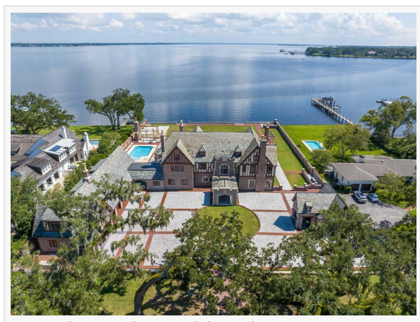
Coveted Riverside Avondale enclave

Though Jacksonville might be a large city, it maintains its laid-back feel with over 80,000 acres of public parkland, including the Timucuan Ecological and Historical Preserve, over 1000 miles of shoreline, and 22 miles of white sand beaches. Jacksonville also has booming arts, music, and sports scenes. Riverside Avondale is one of the oldest communities in the city, boasting walkable streets, historic charm, Cummer Museum of Art and Gardens, and boutique shopping, dining, and nightlife. Enjoy the oldest course in Jacksonville, Hyde Park Golf Club, only 10 minutes away. Take the boat on the St. Johns River to fish, explore Exchange Island, or cruise the many waterside cafes and restaurants. 3730 Richmond Street is an 18,749 squarefoot mansion with six bedrooms and ten bathrooms, sitting on a 2.22 acre lot. The property was originally built in 1928 and has many details typical for this time period including multiple fireplaces, hardwood floors, built-ins and millwork, stained windows, and vaulted groove ceilings. The grand foyer showcases a wooden staircase and wainscotting. The chef's kitchen features a large island with bar seating.