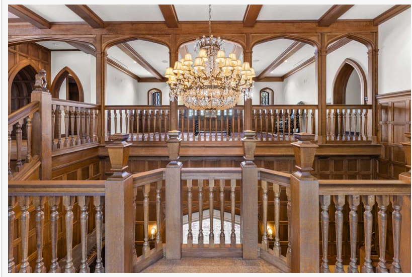
Gorgeous period details and intricate woodwork

Concierge Auctions is the world's largest luxury real estate auction marketplace, with a state-of-the-art digital marketing, property preview, and bidding platform. The firm matches sellers of one-of-a-kind homes with some of the most capable property connoisseurs on the planet. Sellers gain unmatched reach, speed, and certainty. Buyers receive curated opportunities. Agents earn their commission in 30 days. Acquired by Sotheby's, the world's premier destination for fine art and luxury goods, and Anywhere Real Estate, Inc. (NYSE: HOUS), the largest full-service residential real estate services