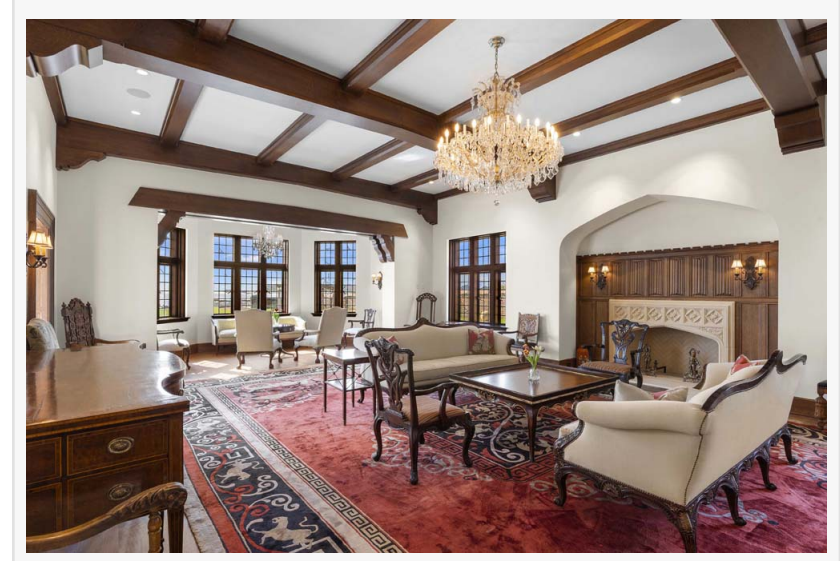
1928 Tudor Revival estate on National Historic Register

A copper vent hood, built-in pot filler, and custom cabinetry are sure to impress a chef of any level. The primary sanctuary boasts a spa-like bath with separate vanities, a stand-alone tub, and walk-in shower. The property features a guest suite, sauna, entertainment room with a wet bar, wine cellar, and a swimming pool overlooking the water views. The property itself is 6 miles from Downtown Jacksonville, and 30 minutes from the beaches. Venture two hours to Orlando or Savannah.