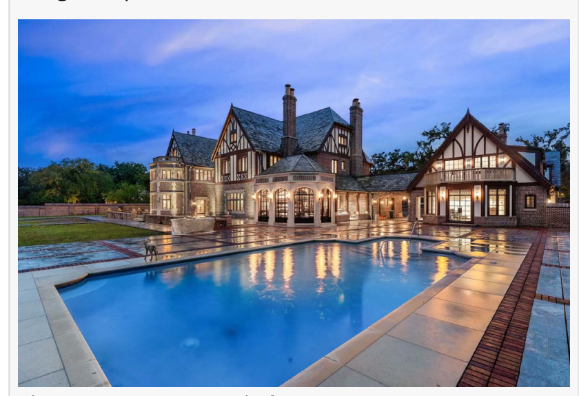
Showpiece estate ready for entertaining

company in the United States, Concierge Auctions continues to operate independently, partnering with real estate agents affiliated with many of the industry's leading brokerages to host luxury auctions for clients. For Sotheby's International Realty listings and companies, Concierge Auctions provides Sotheby's brand exclusivity as Sotheby's Concierge Auctions. Since inception in 2008, the firm has generated billions of dollars in sales, broken world records for the highest-priced homes ever sold at auction and conducted auctions in 46 U.S. states and 36 countries. The firm owns one of the most comprehensive and intelligent databases of high-networth real estate buyers and sellers in the industry, and it has committed to build more than 300 homes through its Key For Key® giving program in partnership with Giveback Homes™, which funds new homes for families in need from every property the company sells. For more information, visit ConciergeAuctions.com.