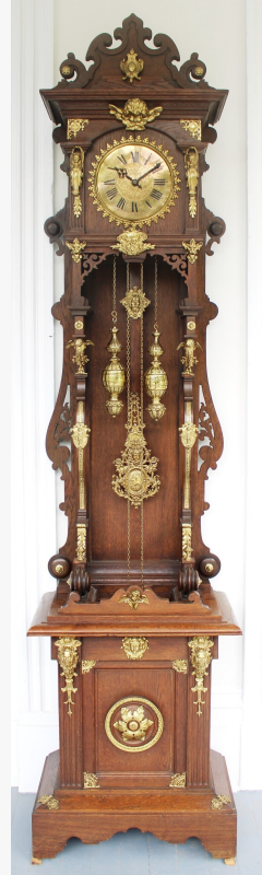
19th century Austrian clock, a true masterpiece of craftsmanship and elegance featuring an 8-day weight driven time and strike movement and bronze engraved dial (est. $6,500-$10,000).