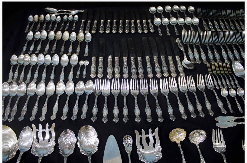
Very large Art Nouveau sterling silver flatware set, 220 pieces, Frontenac pattern by Simon Hall Miller and Company (est. $5,000-$10,000).