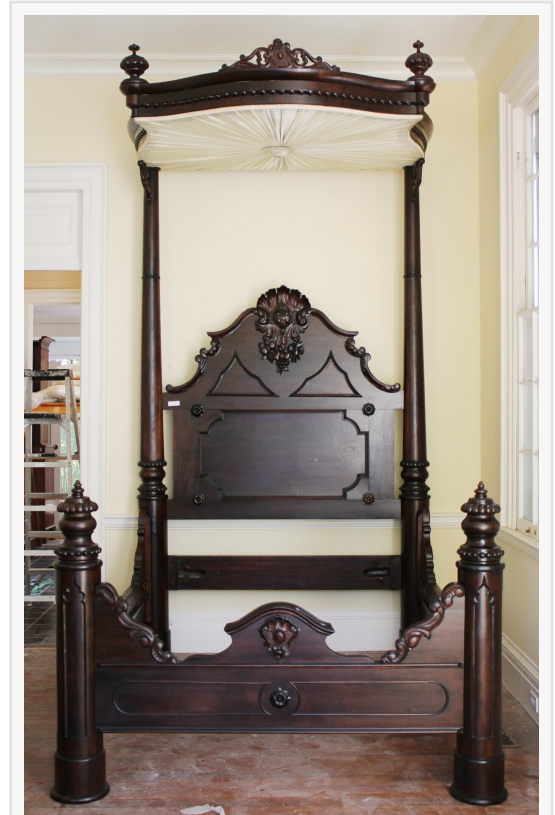
Mahogany empire rococo half tester bed signed C. Lee, 12 feet tall. A standard queen size mattress will fit the bed (est. $20,000-$30,000).

Dwight Stevens Stevens Auction Company +1 662-369-2200 email us here