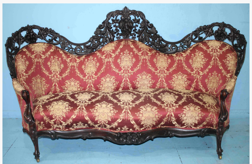
Magnificent laminated rosewood parlor sofa by J. H. Belter, 7 feet long, 47 inches tall (est. $30,000-$50,000).

NATCHEZ, MISS., UNITED STATES, September 22, 2023 / EINPresswire.com/ -- Stevens Auction Company will hit the road on Saturday, October 7th, for the on-site sale of the contents of The Briars in Natchez – the very place where Confederate States President Jefferson Davis was married. The auction will be held at the home itself, located at 130 John R. Junkin Drive, Natchez, with access via the entrance to the parking lot of the Vue Hotel.