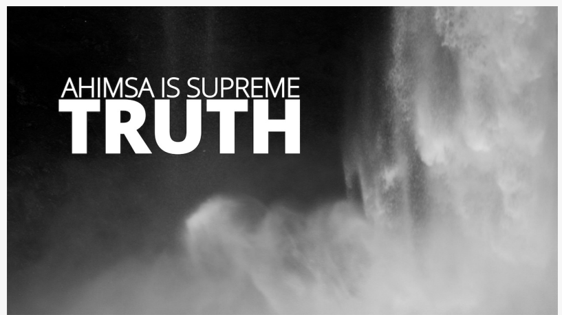
Ahimsa Is Truth

Through archival footage, photographs, and inspirational songs, the film artfully weaves a