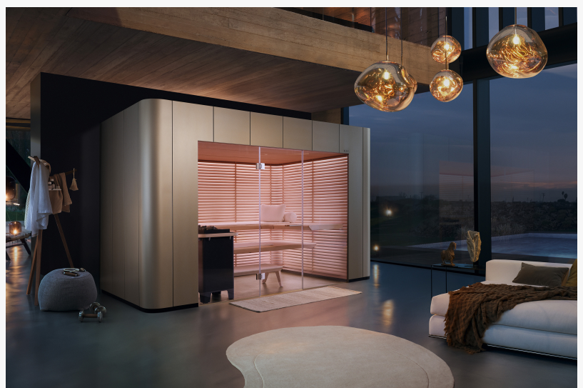
KLAFS limited-edition Sauna S11, designed by Studio F.A. Porsche, will be available in the US November 2023.

EINPresswire.com/ -- KLAFS, the industry leader in sauna and wellness solutions, is proud to announce the S11 Sauna, the latest in its line of design-forward collaborations with renowned architects, designers and design studios. The S11, designed by Studio F.A. Porsche, redefines the concept of relaxation and wellness, marrying state-of-the-art technology with breathtaking design. The S11 Sauna makes its US debut at the WestEdge Design Fair LA (Nov. 16-18). The S11 Sauna is exclusively available from KLAFS USA and interested parties can be waitlisted for the custom-fitted, limited-edition sauna on the KLAFS USA website .