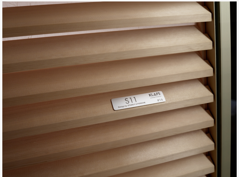
Each limited edition S11 Sauna, designed by Studio F.A. Porsche, has a unique signet.