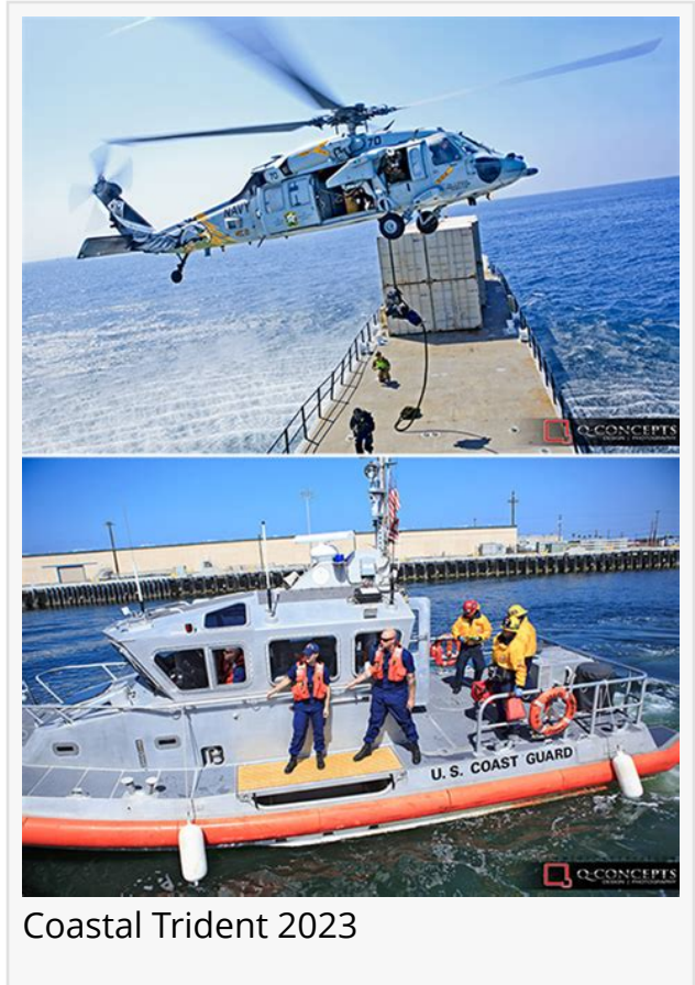
Coastal Trident 2023

EIN Presswire's priority is source transparency. We do not allow opaque clients, and our editors try to be careful about weeding out false and misleading content. As a user, if you see something we have missed, please do bring it to our attention. Your help is welcome. EIN Presswire, Everyone's Internet News Presswire™, tries to define some of the boundaries that are reasonable