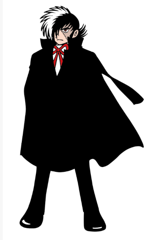
Black Jack ©TEZUKA PRODUCTIONS

Black Jack is a genius unlicensed surgeon who saves patients from deadly emergencies. Despite