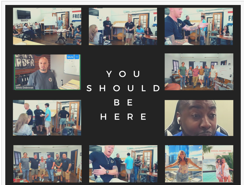
you should be here