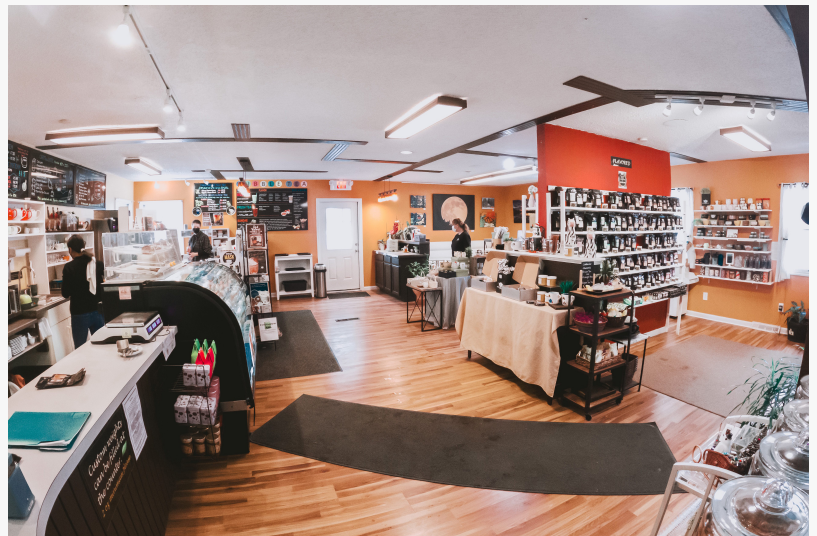
First Floor of Short and Stout Tea Lounge