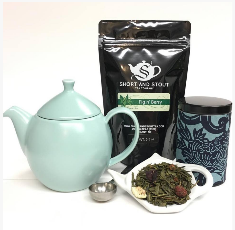
Short and Stout's menu includes 150 types of tea

This press release can be viewed online at: https://www.einpresswire.com/article/657640037