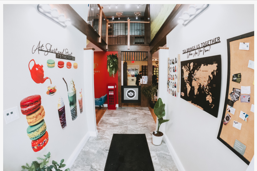
Short and Stout Front Door Entrance