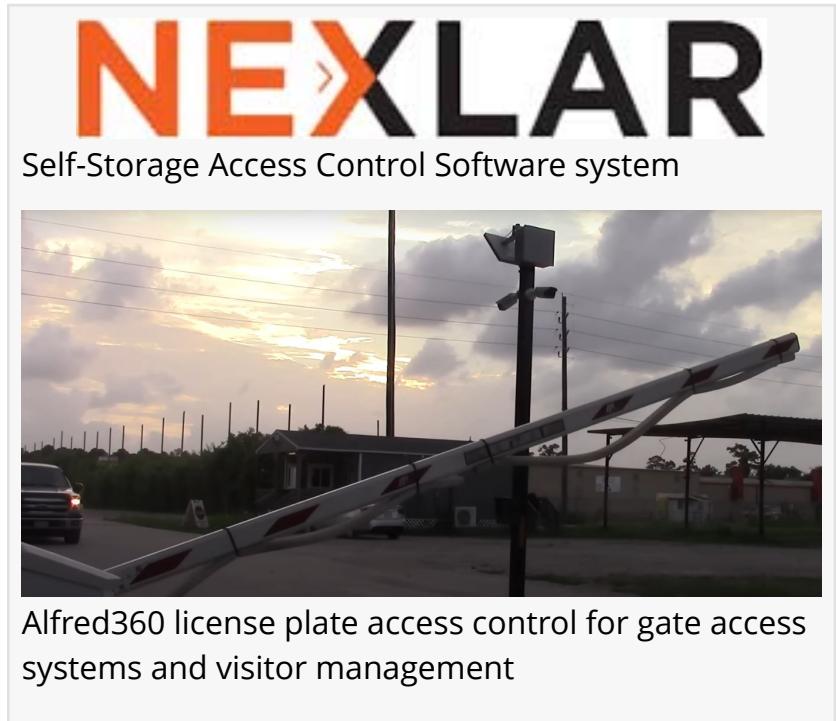
Alfred360 license plate access control for gate access systems and visitor management

HOUSTON, TEXAS, USA, September 25, 2023 /EINPresswire.com/ -- Leading the charge in self-storage security solutions, Nexlar is proud to announce the launch of "Free Access Control." This groundbreaking access control software system, tailored specifically for the unique needs of self-storage facilities, boasts advanced features like recurring billing, innovative gate maintenance alerts, intelligent camera integration, and license plate recognition. In an industry-first move, the hardware for this cutting-edge system is being offered entirely free of charge for the hardware. Self-storage facilities only bear the costs of installation and licensing. Call us for more details