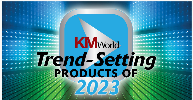
AllegroGraph - Trend Setting Product 2023

LAFAYETTE, CA, USA, September 26, 2023 /EINPresswire.com/ -- Franz Inc. , an early innovator in Artificial Intelligence (AI) and leading supplier of Graph Database technology for Entity-Event Knowledge Graph Solutions, today announced it has been named a " 2023 Trend Setting Product " by KMWorld.