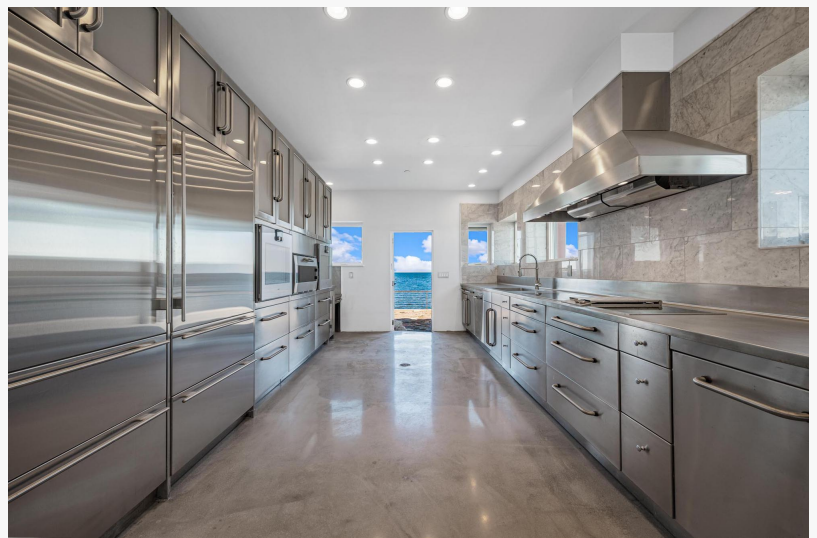
A panorama in every direction from Long Island Sound to NYC

Concierge Auctions is the world's largest luxury real estate auction marketplace, with a state-of-the-art digital marketing, property preview, and bidding platform. The firm matches sellers of one-of-a-kind homes with some of the most capable property connoisseurs on the planet.