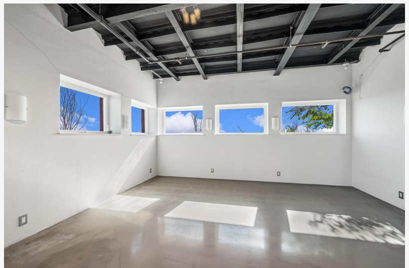
Open beach and potential for development