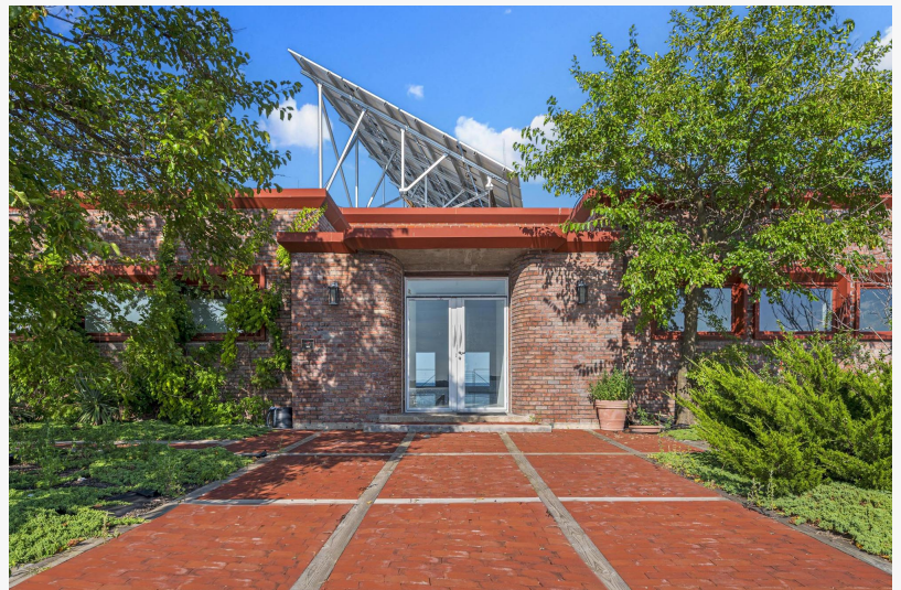
4-bedroom 5,624sf self-sustaining oasis on Columbia Island