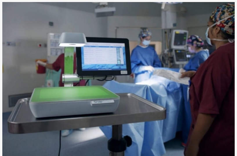
Snap&Go computer vision at the point of care..

The image-to-data revolution makes the task of documenting product usage and charge capture in surgery a quick and effortless task, and the data collected feeds the hospital EMR, ERP and MMIS systems. The next-generation technology enhances patient safety, supports optimized inventory management and boosts case revenue.