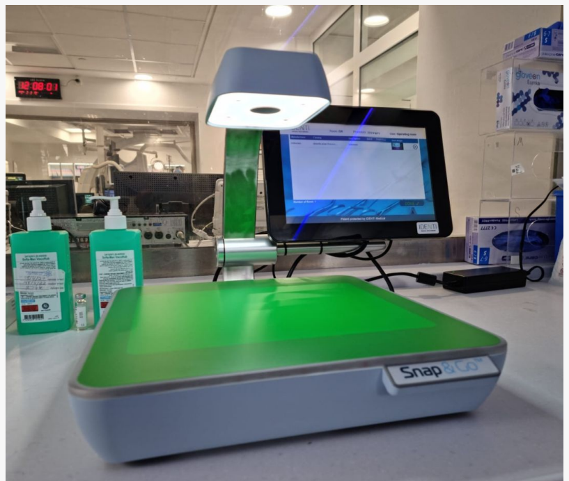
Image sensing technology is revolutionizing point of care documentation