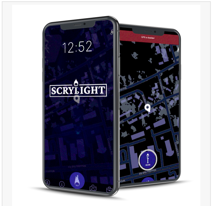
Scrylight Mockup 1

In 1842, Spiritualist Jeremiah Scry wrote his infamous book outlining his own methods for allowing the living to view and interact with the dead through the use of forbidden illumination techniques and rituals. All in the hope of recording evidence of 'life after death.' Then one day Scry vanished, along with his mysterious book. Now over 100 years later, a set of Scry's papers have been recovered, his ancient light rituals updated to the digital age thanks to the power of augmented reality. Scry's use of illumination techniques