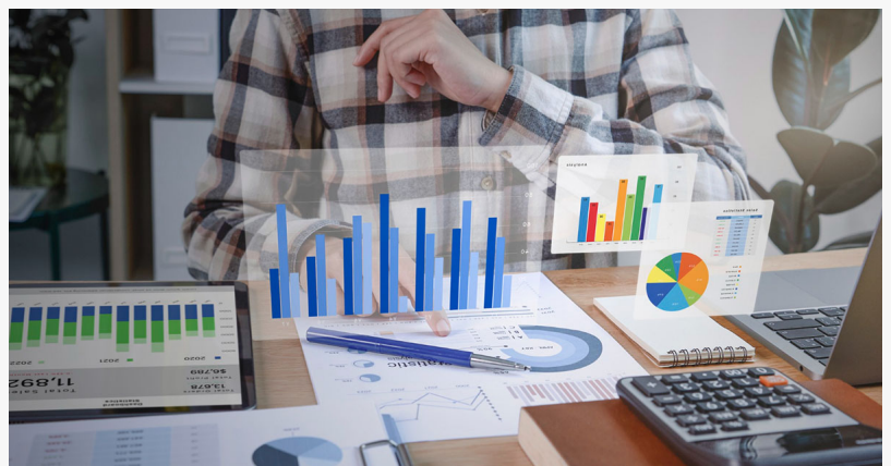
West Palm Beach SEO Services

Proper planning well in advance is pivotal for a smooth transition considering the potential for disruptions from hurricanes. Those looking to move between June and November would be wise to begin exploring logistics and coordinating services at least two months ahead of time. This allows flexibility in the event a named storm requires postponing certain aspects of the process. Relatedly, homeowners and renters