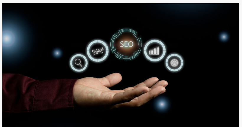
Blue Logic IT Solutions

For those owning valuables that clearly cannot be moved such as boats, RVs, and expensive outdoor property, exploring short-term indoor storage holds peace of mind. Facilities with backup generators safeguard items through outages while owners reside elsewhere until the season concludes. Renters in apartments may sign short leases if buildings lack essential amenities during emergencies. Having alternate lodging arrangements is fundamental for hurricane season relocations.