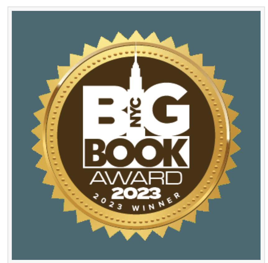
NYC Big Book Award 2023 Winner Seal

The Adventures of Blue Ocean Bob children's book series, which includes a picture book (Blue Ocean Bob Discovers His Purpose, available in English and Spanish) and four early chapter books (A Journey Begins, A Challenging Job, Into the Lead, and A Secret in the Deep), teaches kids timeless achievement principles and promotes ocean awareness. For more information and a free Parent & Teacher Guide, visit blueoceanbob.com. You can follow Blue Ocean Bob at www.facebook.com/blueoceanbob and on Twitter (@BlueOceanBob).