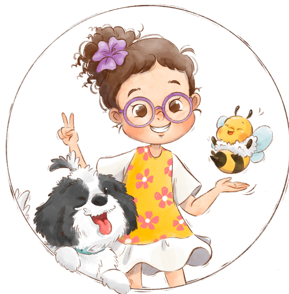
The Funtastic Trio