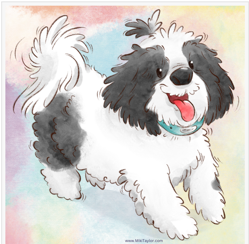
Meet Bentley Main Character - Bentley's Fantabulous Idea