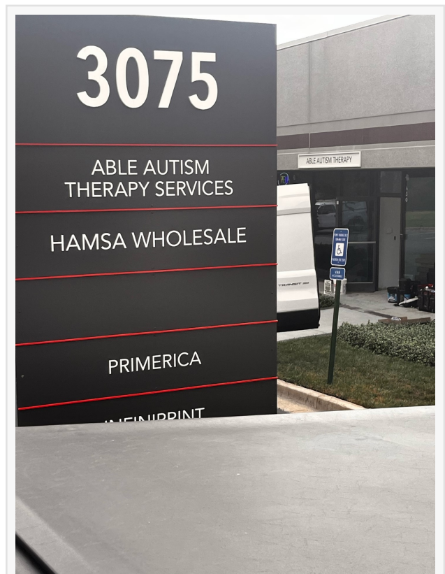
Able Autism Therapy's newest location is in Duluth, GA

This press release can be viewed online at: https://www.einpresswire.com/article/658002829