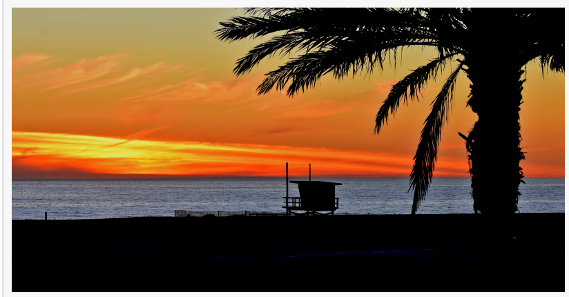
The Spectacular Setting for Summit XII