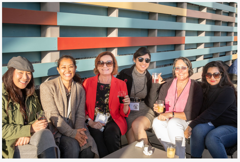
Enjoying the Outdoors

The Los Angeles Chapter is the founding chapter of ISSA International, and its primary goal is to promote management practices that will ensure the availability, integrity and confidentiality of information. The chapter meets monthly at various venues around the Los Angeles region. Each year hundreds of Information Security Leaders gather at the Security Summit to network, learn, and share problems and solutions. Internationally renowned speakers and trainers travel to SoCal to participate in this event.