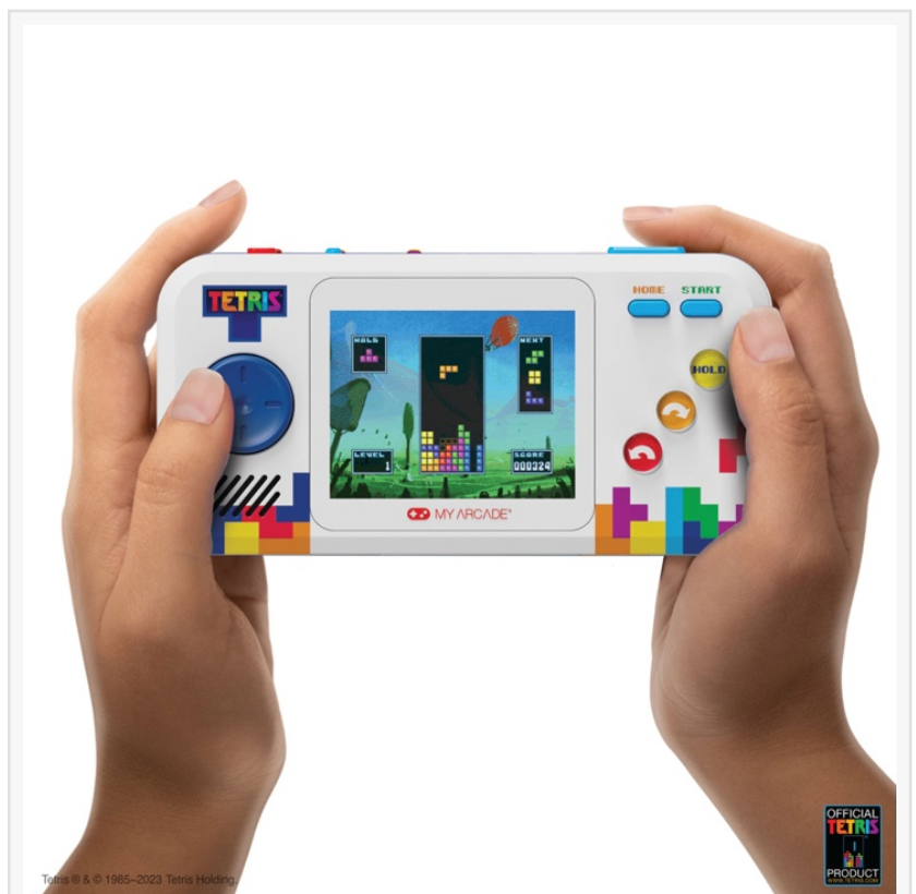
TETRIS Pocket Player Pro