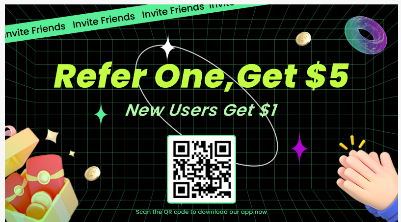
Refer one, get $5!