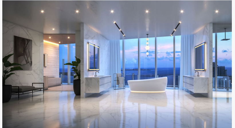
Aston Martin Residences Interior Bathroom