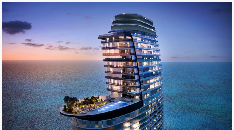
Outside View of The Aston Martin Residences in Miami

MIAMI, FLORIDA, USA, September 27, 2023 /EINPresswire.com/ -- Downtown Miami prepares to embrace an unprecedented evolution in luxury living as the Aston Martin Residences gears up for its grand unveiling in December. Esteemed for its legacy in automotive excellence, Aston Martin's maiden venture into the luxury real estate scene promises to redefine opulence.