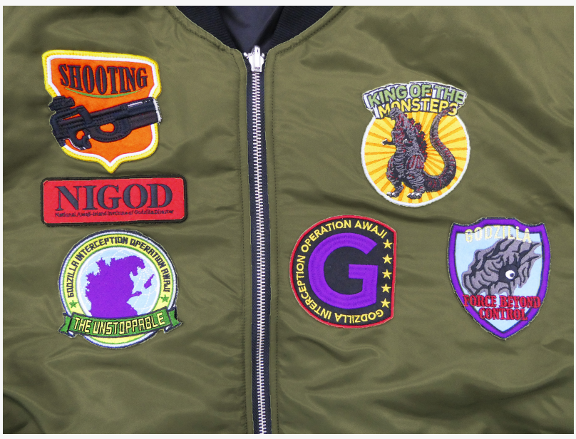
Closeup of original badge designs