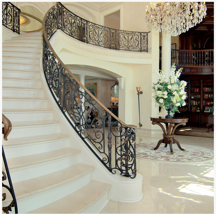
An image of the inside of the estate.

The lower level features a gourmet kitchen complete with high-end appliances, a hidden home office, a first-floor bedroom vestibule with a hand-painted Charles Guard mural, a dining room with 20-foot ceilings, rounded arches and one of two Schonbek Swarovski crystal chandeliers. The meticulous use of marble throughout select bedrooms and bathrooms further underscores the home's opulence and timeless beauty.