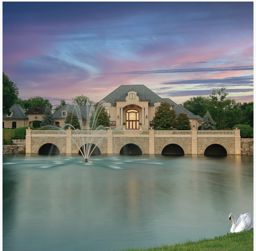
An image of the front of the estate.

Notably, The Summit Hills Country Club, established in 1928, is just under a mile from the estate.