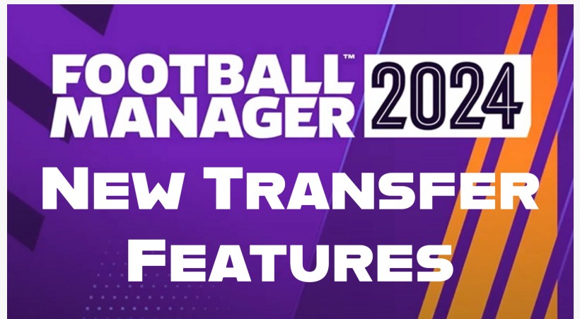
Football Manager 2024 Innovations

EINPresswire.com/ -- Introduction Football Manager 2024 introduces significant updates with a focus on player transfers and squad management. The addition of FM24 Intermediaries and other features aims to transform the player transfer process.