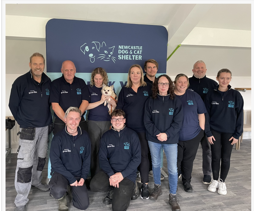
Dog & Cat Shelter Team new uniforms

NEWCASTLE, TYNE & WEAR, ENGLAND, September 29, 2023 / EINPresswire.com/ -- Award-winning Brand Communication Agency, Guerilla , has taken a bold step in championing animal welfare by partnering with the esteemed Newcastle Dog & Cat Shelter . In a heart-warming gesture of community spirit and support, Guerilla will be sponsoring and providing all the uniforms for all the shelter's dedicated staff.