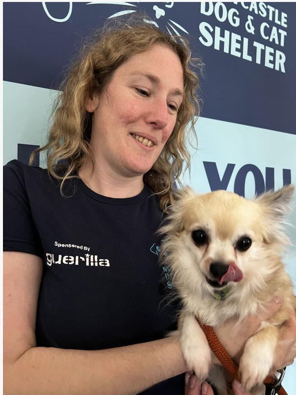
Caring and sharing

This press release can be viewed online at: https://www.einpresswire.com/article/658153292