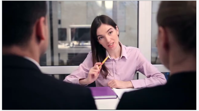
Health Insurance Houston

This press release can be viewed online at: https://www.einpresswire.com/article/658242991