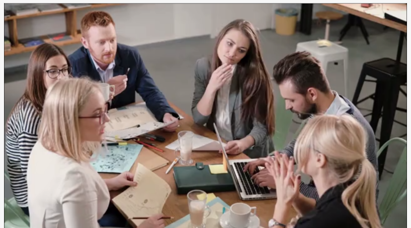
Houston Health Insurance