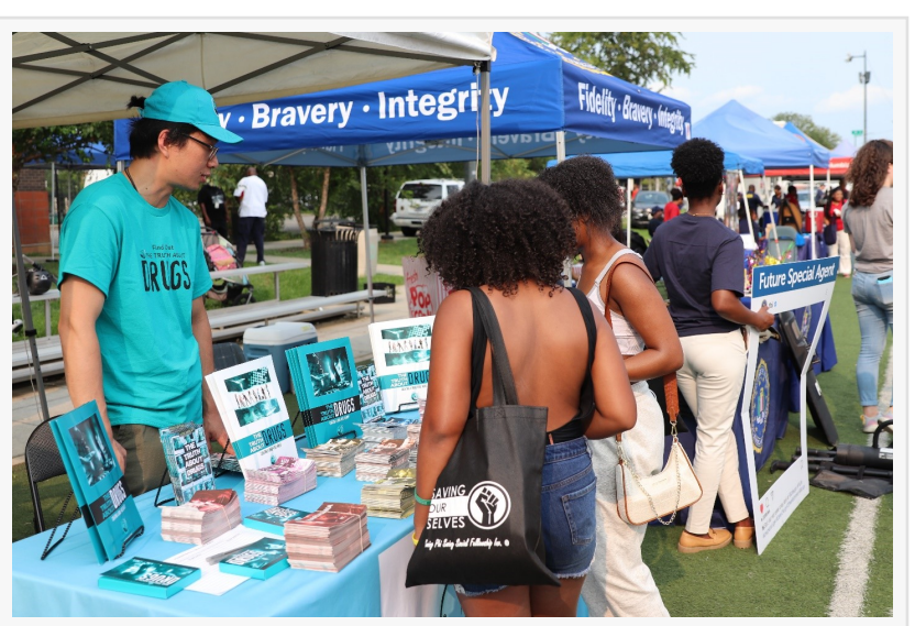
Foundation for a Drug-Free World volunteer sharing information with community members at an outdoor event

WASHINGTON, DC, USA, September 28, 2023 /EINPresswire.com/ -- For National Substance Abuse Prevention Month in October, the Foundation for a Drug-Free World's Washington, DC, chapter is doing drug education talks and offering free booklets and materials to fight against the growing tide of overdose deaths from painkillers and opioids. The foundation is offering training on opioids and how to help family and friends stay away from dangerous overdoses.