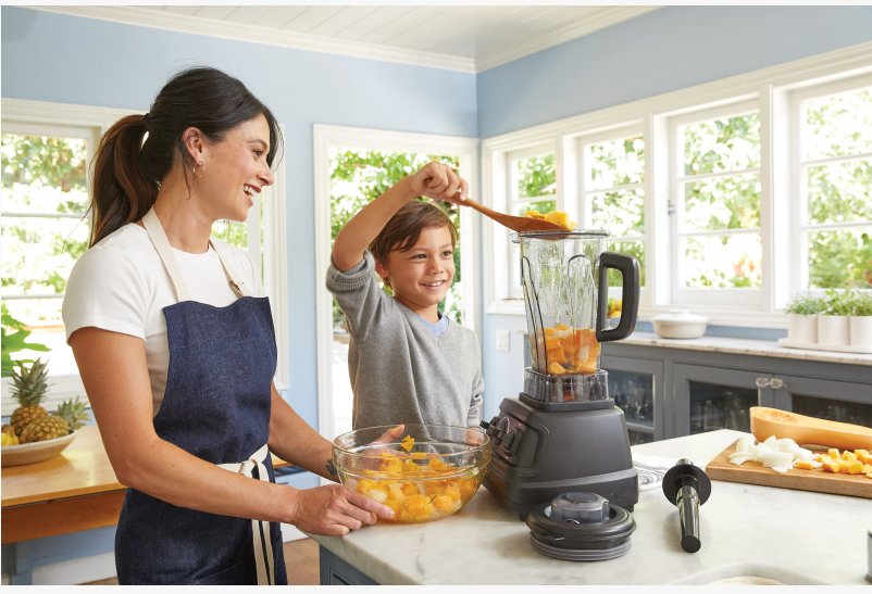
Group Health Insurance Plano