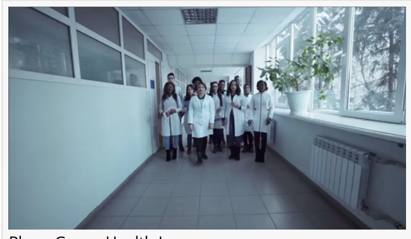
Plano Group Health Insurance

PLANO, TEXAS, USA, October 12, 2023 /EINPresswire.com/ -- <u>Plano Group</u> <u>Health Insurance</u> has extended a crucial lifeline to displaced workers and their families, particularly those impacted by recent industrial challenges. Due to the latest employment disturbances, a joint effort with local charitable organizations has been forged to offer