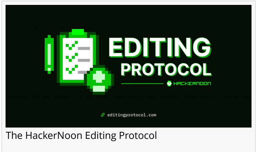
The HackerNoon Editing Protocol

humans and machines to determine whether a story is worth publishing, how to specifically improve the story’s content, and how to distribute the story with more reach and relevance.