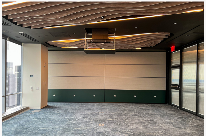
Skyfold Zenith Premium 60

The installation featured a trio of exceptional products from ModernfoldStyles' extensive collection: