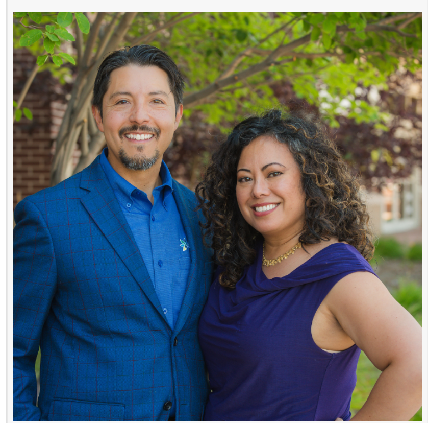
Axis Integrated Mental Health's Cofounders

The advantages of Axis Integrated Mental Health's TMS Treatment