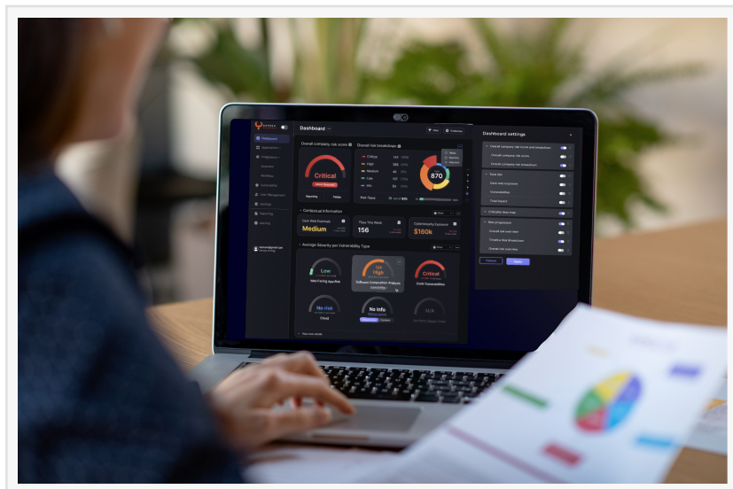
Phoenix Security Platform