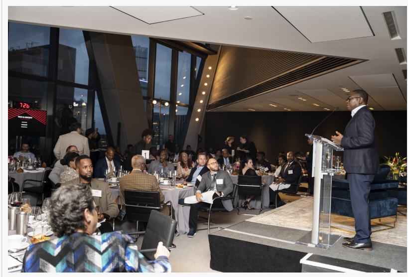
Culture Shift Summit

The next <u>Culture Shift Summit</u> will