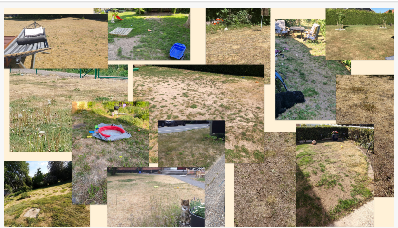
Ugly lawns shared by Swedes 2023

"If more people can see the beauty in an ugly lawn, the world can save a lot of water" MARCUS NORSTRÖM