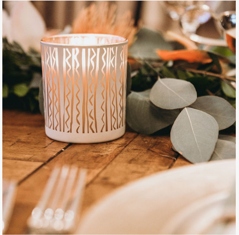
Soy Candle - Puakenikeni Scent

This press release can be viewed online at: https://www.einpresswire.com/article/658617851