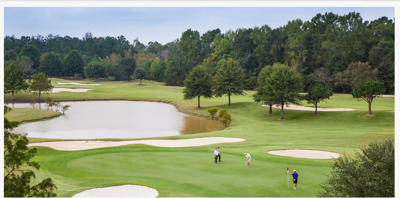
Chairman's Cup Charity Golf Tournament to be Held at Koasati Pines Golf Course

KINDER, LOUISIANA, USA, September 29, 2023 /EINPresswire.com/ -- The Coushatta Tribe of Louisiana will host its 21st annual Chairman's Cup charity golf tournament October 3-5, 2023. These yearly funds are used to support local charities and institutions across Southwest Louisiana.