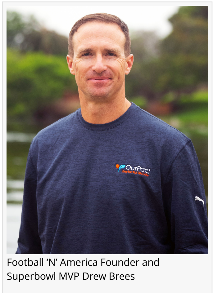
Football 'N' America Founder and Superbowl MVP Drew Brees