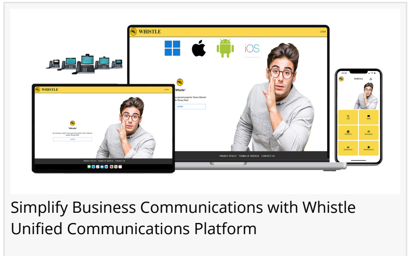
Simplify Business Communications with Whistle Unified Communications Platform

WINNIPEG, CANADA, September 29, 2023 /EINPresswire.com/ -- Whistle Technologies Inc, a B2B SaaS startup headquartered in Winnipeg, Canada announces the release of its Mobile Apps (#Android and #iPhone), in addition to bringing IP Phone integration to its Unified Communications Platform. Whistle has also incorporated in the United States as a Delaware C Corp.