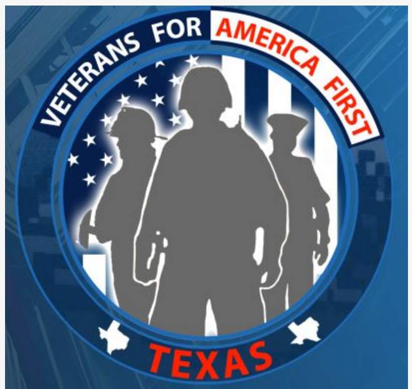
Texas Veterans For America First state chapter logo

This press release can be viewed online at: https://www.einpresswire.com/article/658701197