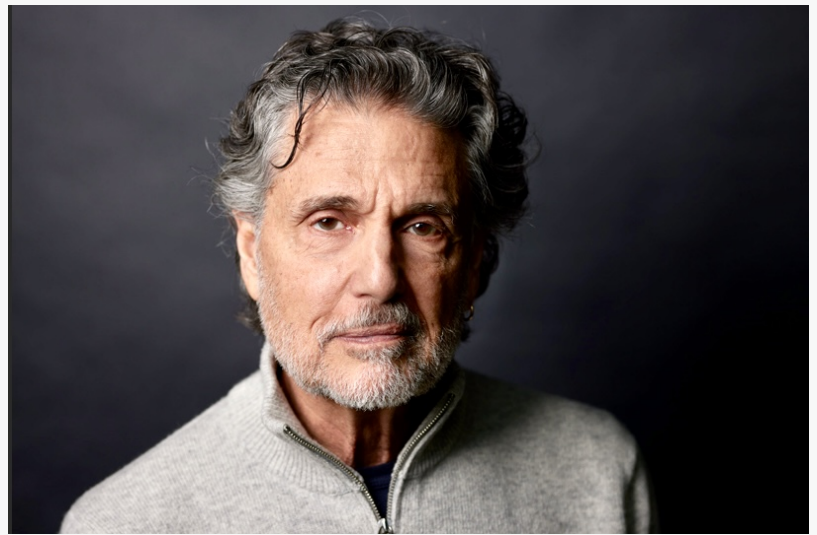
Chris Sarandon.

symphony of flavors, anecdotes, and inspiration. Jane Green is an eighteen-time best-selling author known for her consistently popular novels. Her books have achieved significant commercial success and have been enjoyed by readers worldwide. She excels in crafting novels