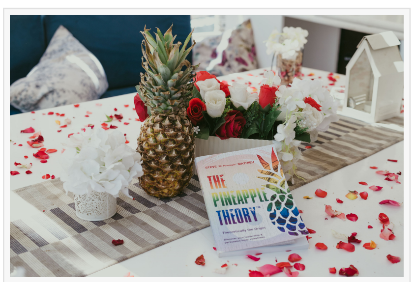
The Pineapple Theory books

MONTREAL, CANADA, October 2, 2023 /EINPresswire.com/ -- October 2023 marks The Pineapple Theory's third anniversary and like a consistent determinate pineapple former, Mr. Pineapple is positively cultivating a growth continuum with the purpose of philosophically adding a pineapple to people's life, leadership, and business recipes to live more "pinehapply," together.