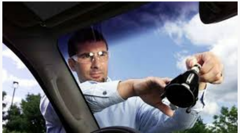
Windshield Repair Man

HOUSTON, TX, UNITED STATES, October 4, 2023 /EINPresswire.com/ -- Patsco Windshield Repair, a reputable name in windshield chip maintenance , has released an informative guide for vehicle owners dealing with the age-old question: Should I opt for windshield chip repair or replacement? This guide is designed to provide consumers with