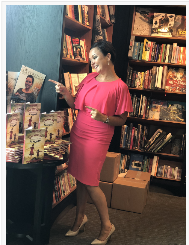
Book launch at Waterstones, Greenwich, London