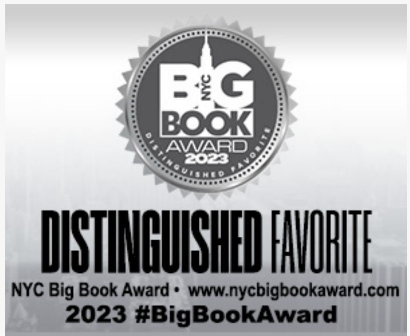
A 2023 NYC Big Book Award Distinguished Favorite