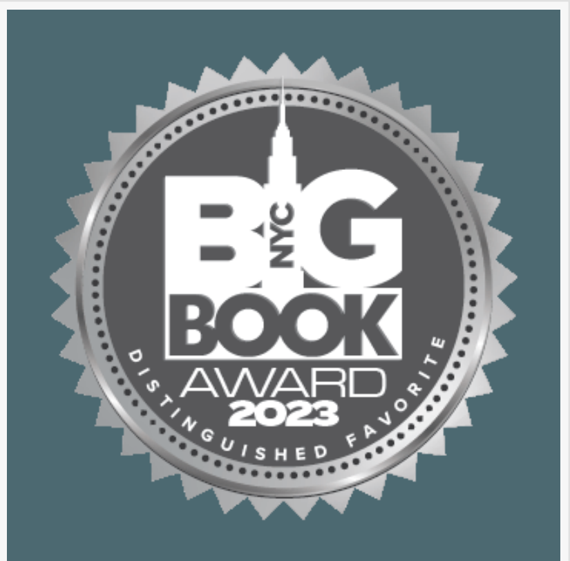
NYC Big Book Award 2023 Distinguished Favorite

The competition is judged by experts from different aspects of the book industry, including publishers, writers, editors, book cover designers and professional copywriters. Selected award winners and distinguished favorites are based on overall excellence.