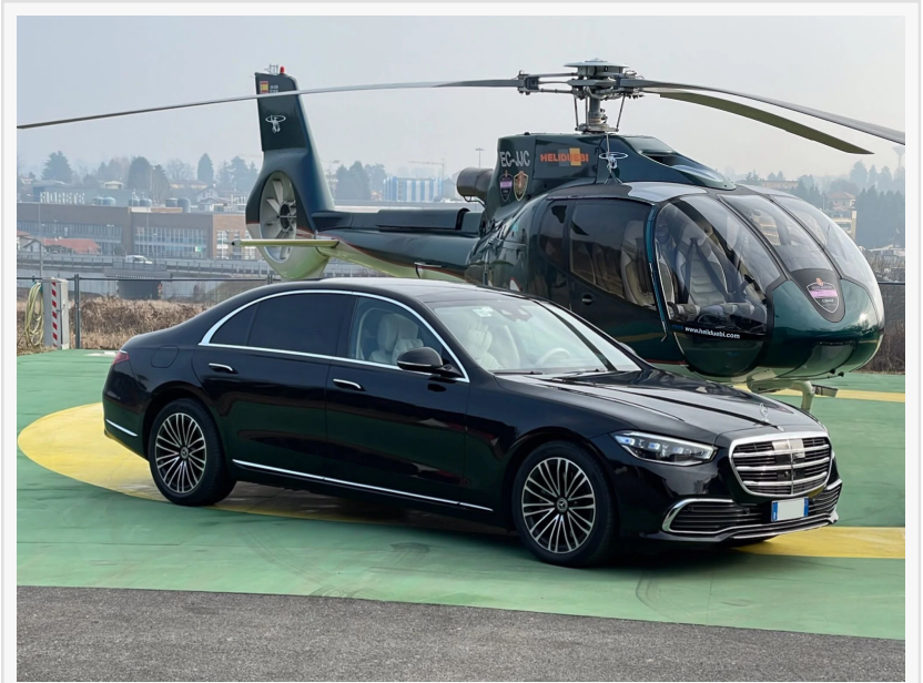
NCC Milan Rental with driver Milan

The credit goes to the rich fleet available to the company. There is something for all tastes: from