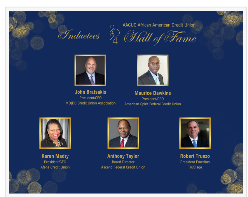
2024 African American Credit Union Hall of Fame Inductees