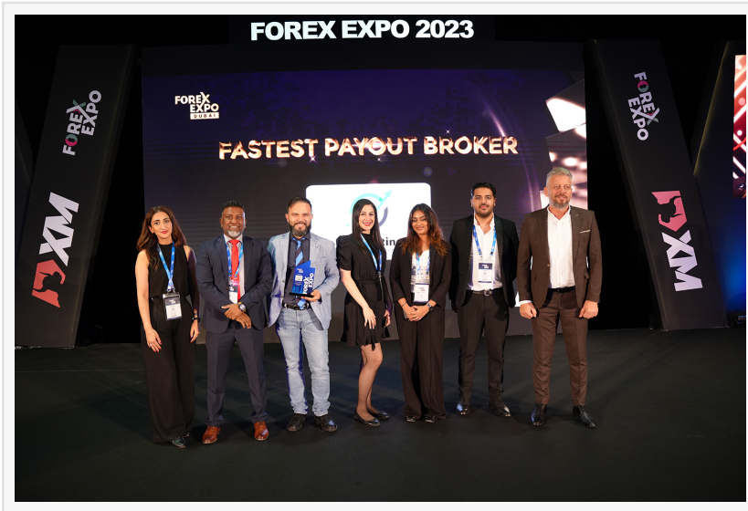
DB Investing's team at Forex Expo Dubai

Fastest Payout Broker for the 2023 -Forex Expo in Dubai: This award acknowledges the broker that has the fastest and most reliable payment processing system for its clients. DB Investing has impressed its clients with