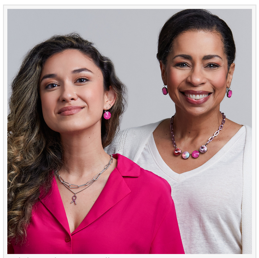
Sabika Pink Power Collection 2023

PITTSBURGH, PENNSYLVANIA, UNITED STATES, October 2, 2023 /EINPresswire.com/ -- Sabika Jewelry (Sabika), a Pittsburgh-based, womanowned jewelry company, is pleased to announce its support of the Breast Cancer Research Foundation (BCRF) through October Pink Parties, their Celebrate your Sparkle Event, and sales of their Pink Power Collection, which will be released on October 1st. Since 2010, the company has raised over $2.2 million for various local and national foundations and nonprofits that support the fight against breast cancer.