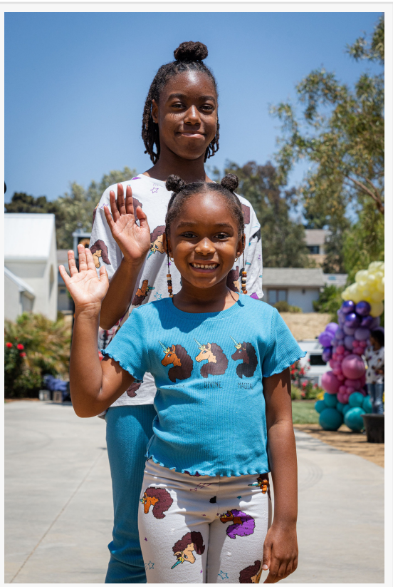
The Afro Unicorn Foundation nurtures and champions young girls.

At the Afro Unicorn Foundation, we are passionate about inspiring young girls to be the best versions of themselves. We strive to provide resources, tools, and support to help them unlock their potential and become confident leaders of tomorrow. We are committed to fostering the growth and development of young girls through our flagship program, which is designed to help