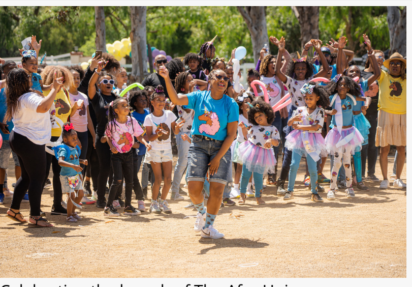
Celebrating the launch of The Afro Unicorn Foundation.